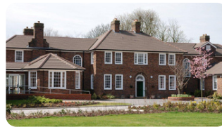
Kiffin Taylor Home