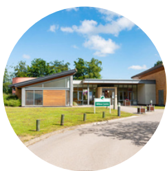
The Willow Centre