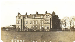
Henry Cox Home