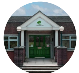
James Page House