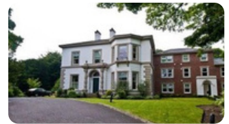
Chapel House Home